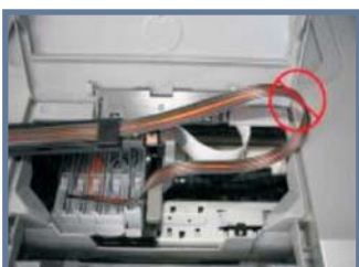
Tube excessive long

4 ADJUST TUBING ▶▶ Adjust the tube length and move the cartridge carriage from left to right for several times. Please make sure there will be no block and collision when the cartridges moving from one side to the other. Insure there's plenty length of tube to make the cartridge carriage can move to the right side thoroughly.